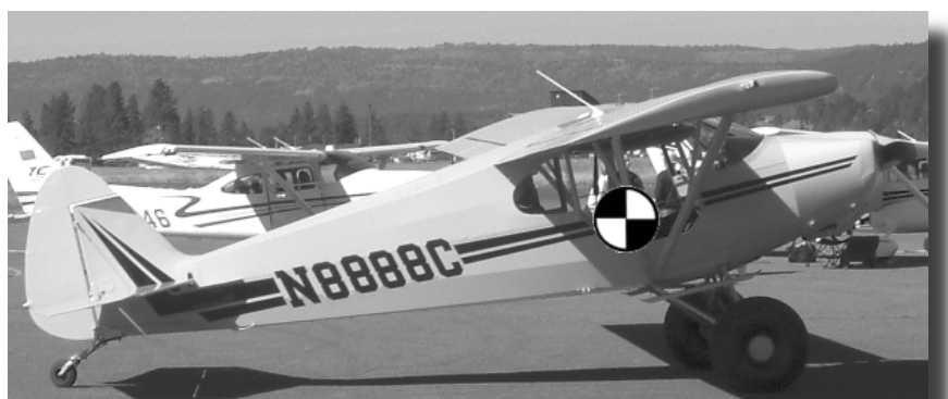
Figure 5. The side view of the taildragger reveals a lot of side area behind the main gear. The cg is behind the main gear.