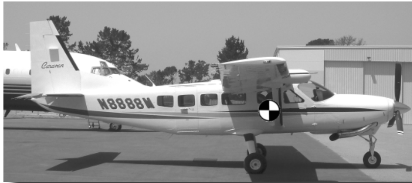
Figure 3. A side view of a tricycle-gear airplane reveals the cg (mass of the airplane) is ahead of the main gear.