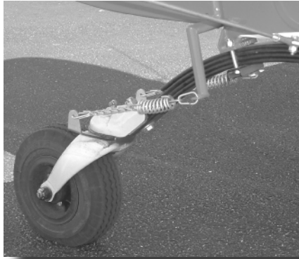
Figure 1. Tail wheel assembly (Aviat Husky). Pulling the stick back to your gut makes steering more effective.