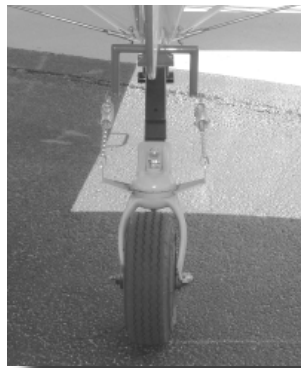
Figure 2. Pay particular attention to the springs during the walk-around inspection checking alignment and security.